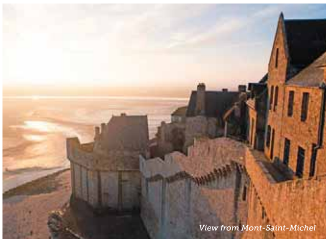
View from Mont-Saint-Michel