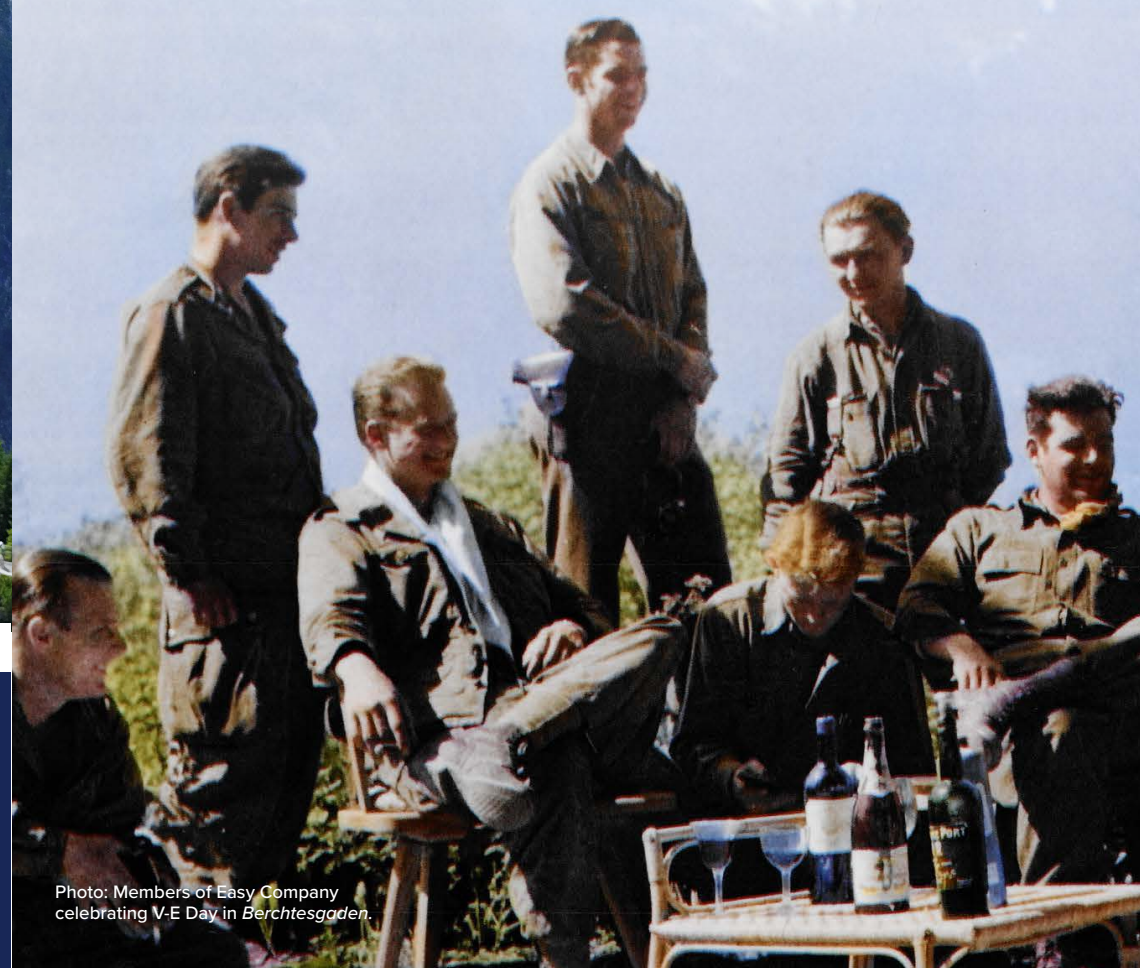
Photo: Members of Easy Company celebrating V-E Day in Berchtesgaden.