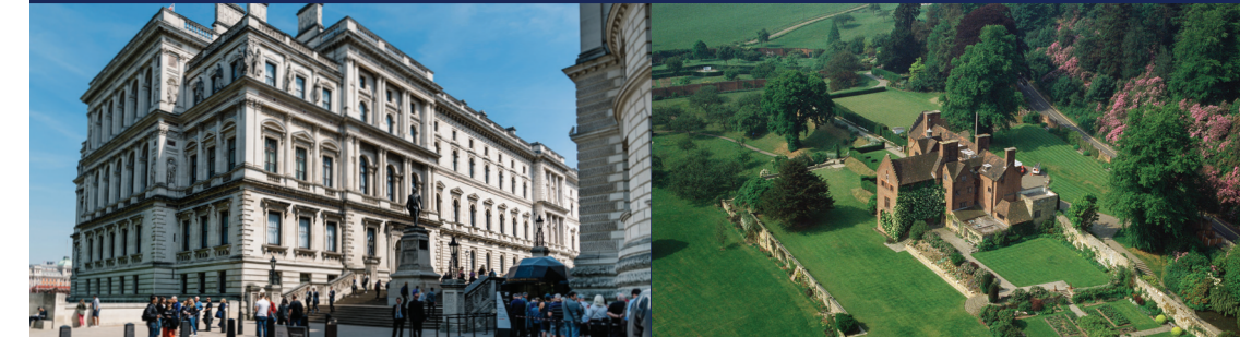
Churchill War Rooms

*$129 per person taxes & fees are additional.