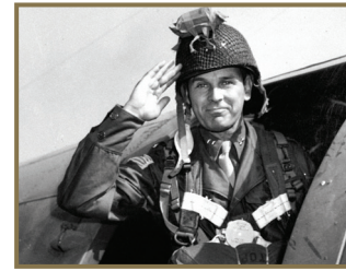
Maj. General Maxwell D. Taylor, Commanding Officer of the 101st US Airborne Division, September 17, 1944.