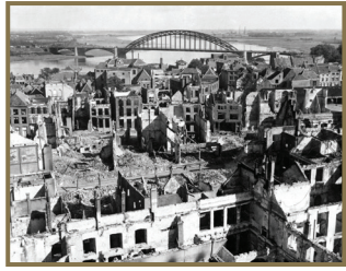
Bridge over the Rhine, Nijmegen.

Hear their stories. Learn their names. Stand where history was made.