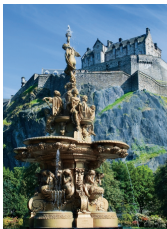
Scotland’s Edinburgh Castle

Day 13: London A panoramic city tour this morning passes such celebrated London landmarks as the infamous Tower of London, grand Parliament and Big Ben, Buckingham Palace, Westminster Abbey,