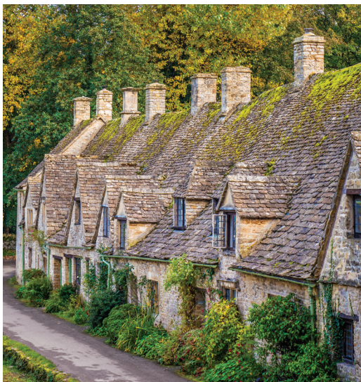
England’s beautiful Cotswolds region