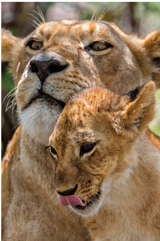
The Serengeti boasts Africa's largest lion population.

Day 16: Arrive U.S. We reach the U.S. today and connect with our flights home.