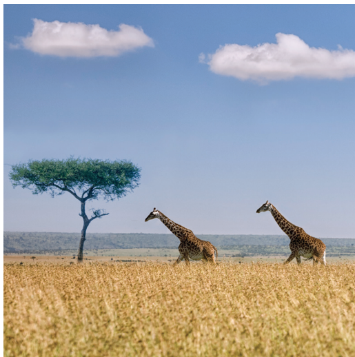
Overlooking the plains ...