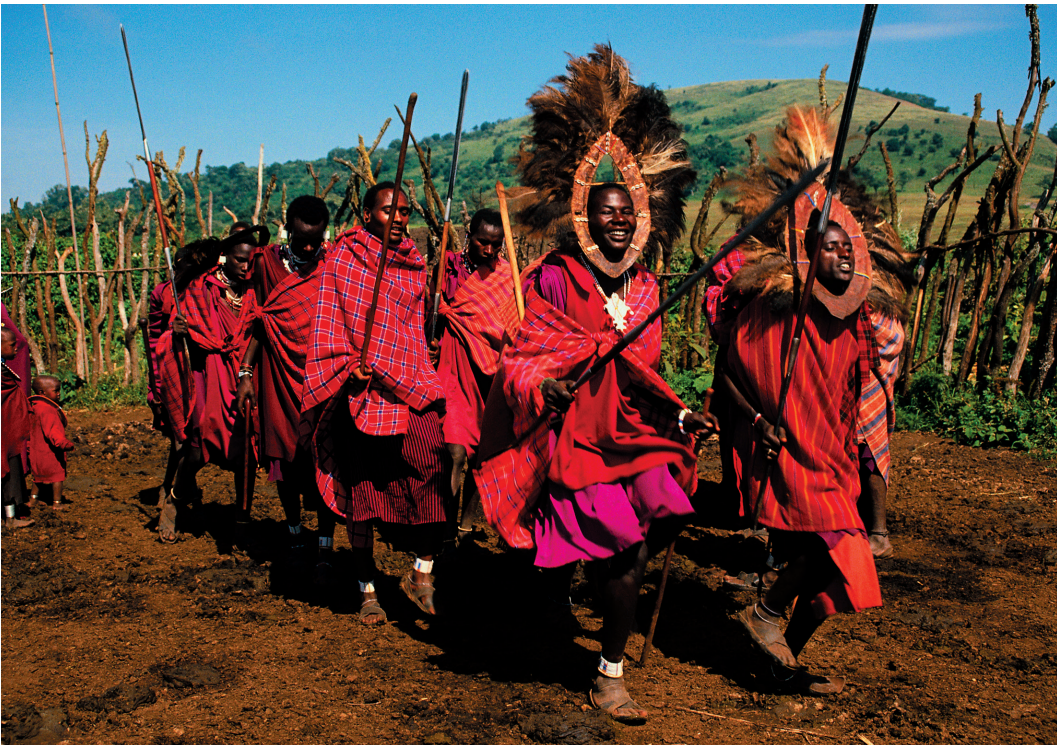
We visit a Maasai village to learn about their culture.

Reserve, and site of Ngorongoro Crater, the world’s largest intact volcanic caldera. On the crater’s floor is Africa in microcosm: grassland, swampland, lakes, forests, mountains, and unparalleled wildlife, including the rare black rhino, hippo, wildebeest, zebra, eland, gazelle, and black-maned lion. B,L,D