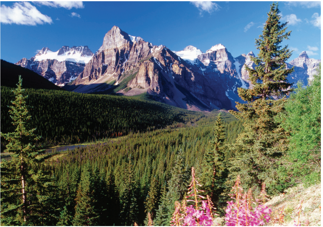
Five national parks sit within the Canadian Rockies.

winding mountain pass that offers breathtaking views and hair-raising turns. After time for lunch on our own we meet up with our motorcoach and continue southwest across the Continental Divide. After arriving late this afternoon in the resort town of Whitefish, Montana, we dine together tonight. B,D