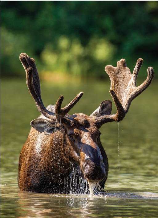
A bull moose enjoys a dip.

Prices include int’l airfare and all taxes, surcharges, and fees.