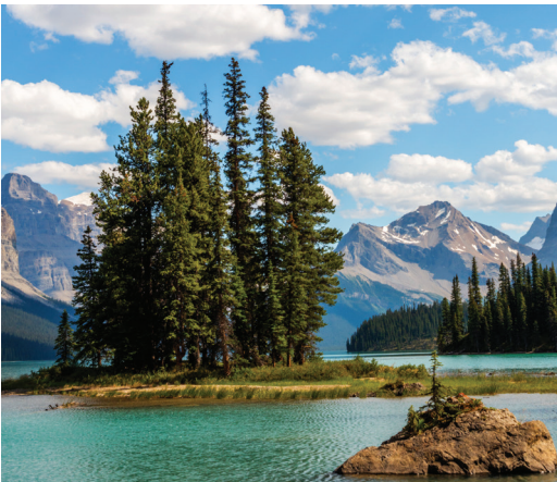
Maligne Lake and Spirit Island, Jasper National Park

Day 11: Banff/Depart for U.S We transfer this morning to the Calgary airport for our flights home. B