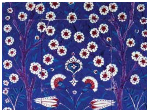
Exquisite Iznik tiles

Day 13: Antalya We discover Antalya’s charming old city (Kaleici) on a morning walking tour through its narrow streets, past historic buildings, mosques, and parks. After lunch at a local restaurant, we visit Antalya’s acclaimed Archaeological Museum, housing priceless artifacts unearthed from sites throughout the region. B,L