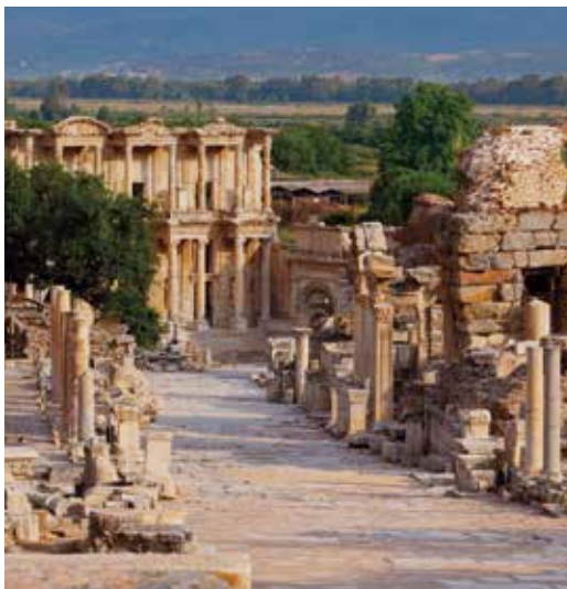
Ruins at Ephesus

Day 14: Antalya/Perge This morning we explore the ruins at Perge, an ancient Greek city once among the world’s prettiest and most prosperous. We also visit the Duden Waterfalls, which tumble about 130 feet into the Mediterranean. Returning to our hotel, this afternoon is at leisure. Tonight, we celebrate our Turkish adventure over a farewell dinner at a harbor-side restaurant. B,D