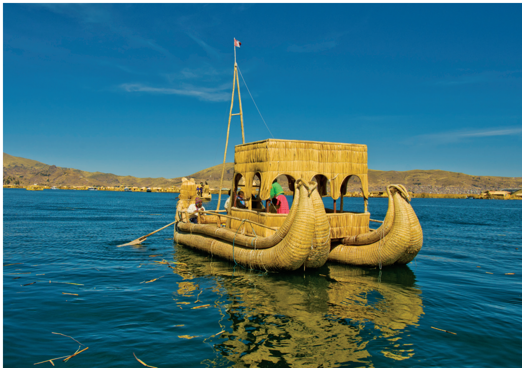
Uros islanders' reed boat sails Lake Titicaca.

Aguas Calientes and our hotel, with time at leisure before dinner together tonight. B,L,D