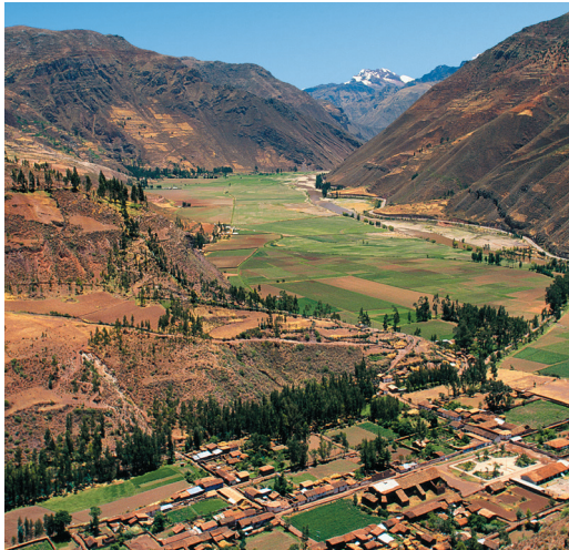
The beautiful and historic Sacred Valley

Day 11: Arrive U.S. We arrive in the U.S. this morning and connect with our return flight home.