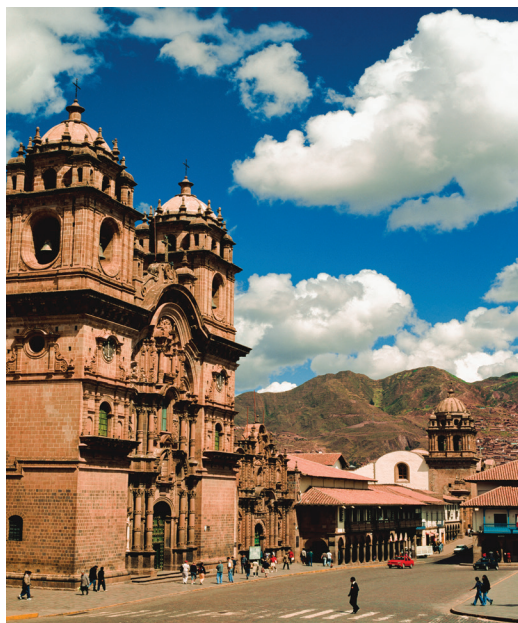
Plaza de Armas, Cuzco

Day 10: Puno/Lima/Depart for U.S. This morning we visit the mysterious burial towers ( chullpas ) at Sillustani over-looking Lake Umayo. After lunch we transfer to the airport for the flight to Lima, where we check into our day rooms at an airport hotel. Late this evening we depart on our flight to the U.S. B,L