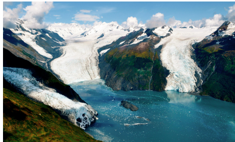
Kenai Peninsula, Prince William Sound