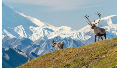
Denali National Park and Preserve