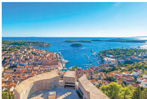
Spanjola Fortress, Hvar