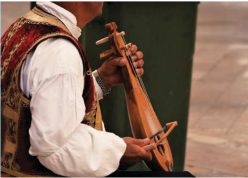
Traditional Croatian musician

This exhilarating itinerary introduces you to Croatia's familiar gems, such as Zagreb and Dubrovnik, as well as lesser-known fishing towns and unspoiled islets. You'll experience an immersive land journey during a three-night stay in Zagreb, plus discover why Croatia is a sailing haven with its gorgeous stretch of coastline, national parks and myriad islands. Get a taste of cruising life as your small vessel glides away from the crowds, pausing at various ports so you can hop off and witness centuries of visible history or sip wine in a café. Back on board, soak up more seascapes before your next port of call!