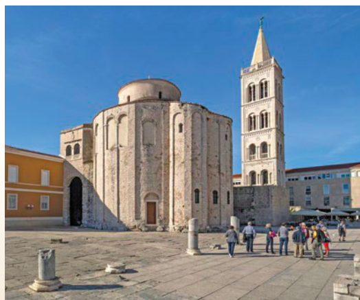
Roman forum and Church of St. Donatus, Zadar

Discovery: Zadar. This storied university town features the impressive Roman Forum and the Church of St. Donatus. Witness the city's modern attractions at its waterfront promenade, including the Sea Organ, a musical art installation. Listen to