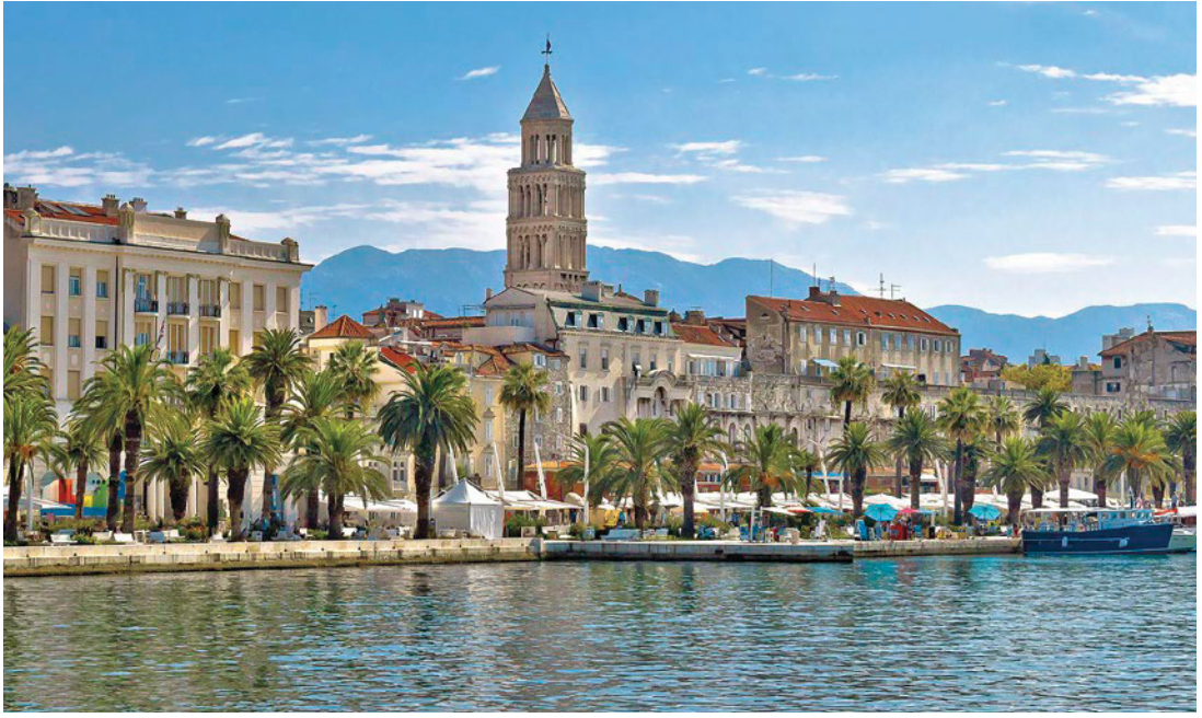
Diocletian's Palace and Riva promenade, Split