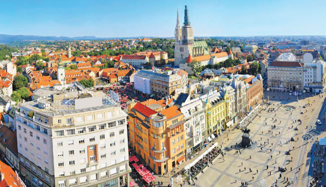
Old town, Zagreb

vivacious Balkan spirit. After a panoramic tour of the lower town, drive to Mirogoj Cemetery, designed by architect Hermann Bollé. Tour the cemetery, then return to Zagreb's beautifully preserved upper town, home to wonderful Austro-Hungarian architecture and more treasures by Bollé, including The Cathedral of Assumption and St. Mark's Church. Originally erected in the 13th century, the church's mosaic roof depicts the Croatian, Dalmatian and Slavic coats of arms, plus those of Zagreb.