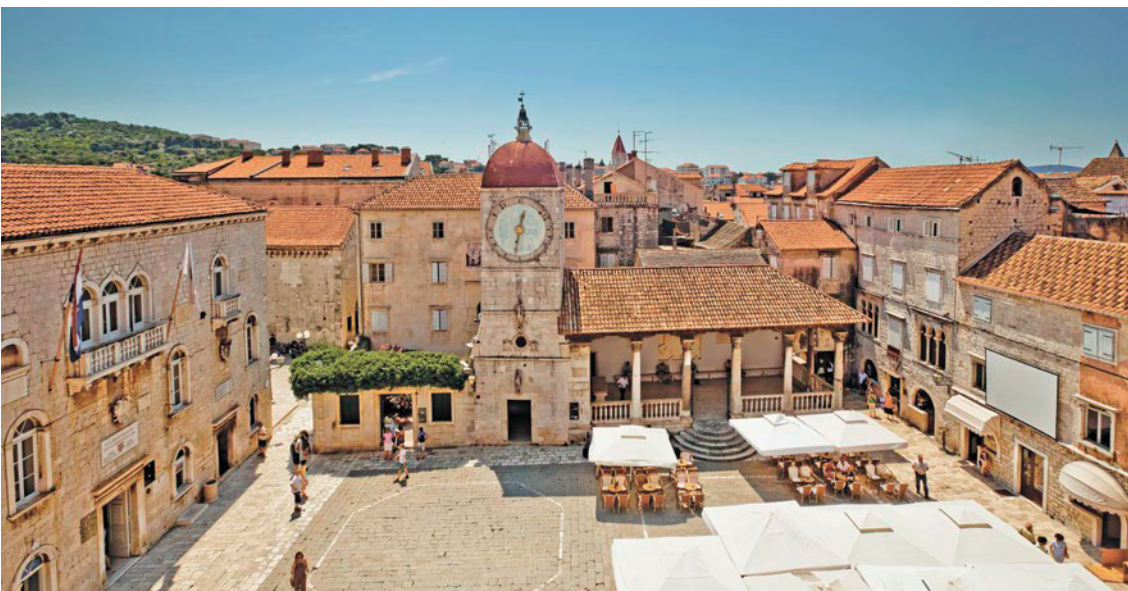
Old town, Trogir