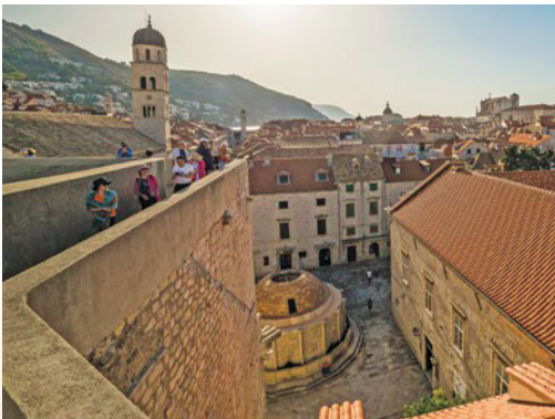
Left: Medieval walls of Dubrovnik

AHI: 800-323-7373 ForOregonState.org/Travel OSUAA: 877-678-2837 www.ahitravel.com