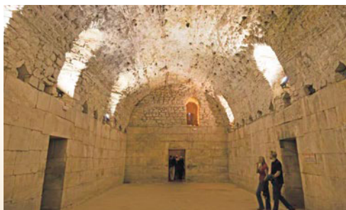
Substructures of Diocletian’s Palace, Split

Lecturers | Coming from all walks of life, our engaging local lecturers open your eyes to history, culture and current events. The breadth of their knowledge deepens your appreciation for the region and its heritage.