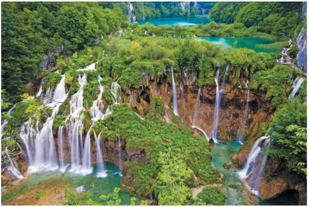
Plitvice National Park