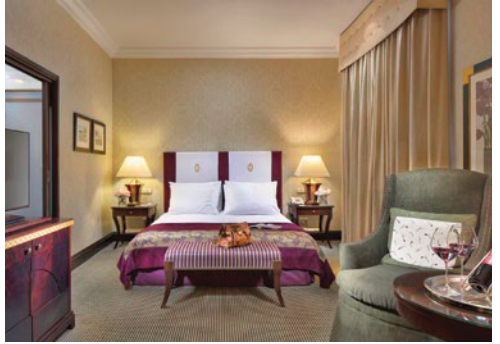
Esplanade Zagreb Hotel | Zagreb