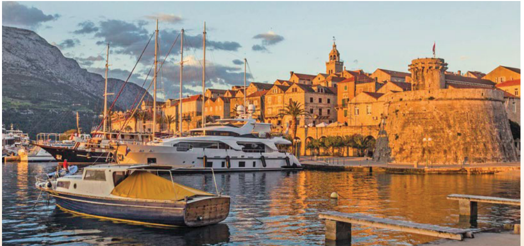
Old town, Korcula

After breakfast, disembark in Opatija. Head inland, stopping for a tour of Plitvice National