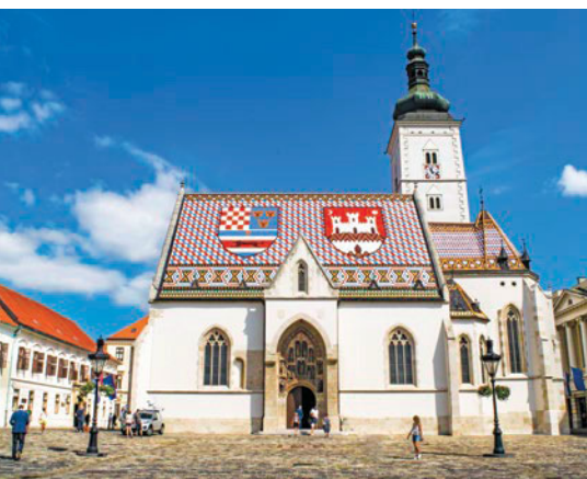
St. Mark's Church, Zagreb

Elective experiences available at an additional cost.