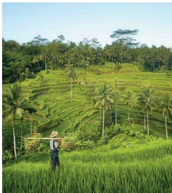
Rice field near Ubud, Bali

Join an enriching 12-night adventure to Southeast Asia, a land of stunning diversity. Begin in beautiful Bali, a treasure trove of cultural landmarks. Fly to Singapore and witness this modern city's fascinating attractions and neighborhoods. Unravel Bangkok's myriad layers found within its winding canals and opulent palaces and shrines. Venture beyond Bangkok to the early Siem capital of Ayutthaya before capping off the journey in Cambodia. Here, encounter the remarkable Angkor Wat and other ancient temples. Along the way, the region's welcoming locals share insights into their lives, cuisine and unique traditions.