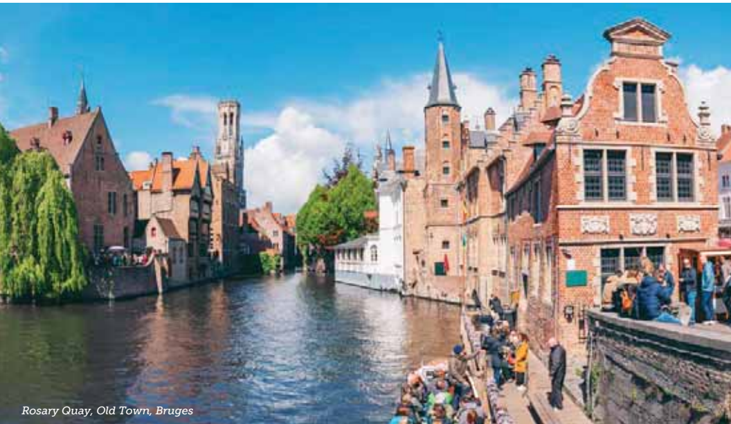
Rosary Quay, Old Town, Bruges

panoramic tour. Next, view the exceptional art at the famed Mauritshuis, which houses Vermeer's "Girl with a Pearl Earring."