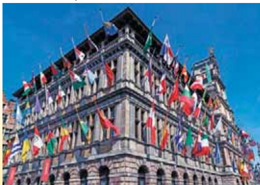
Town Hall, Antwerp