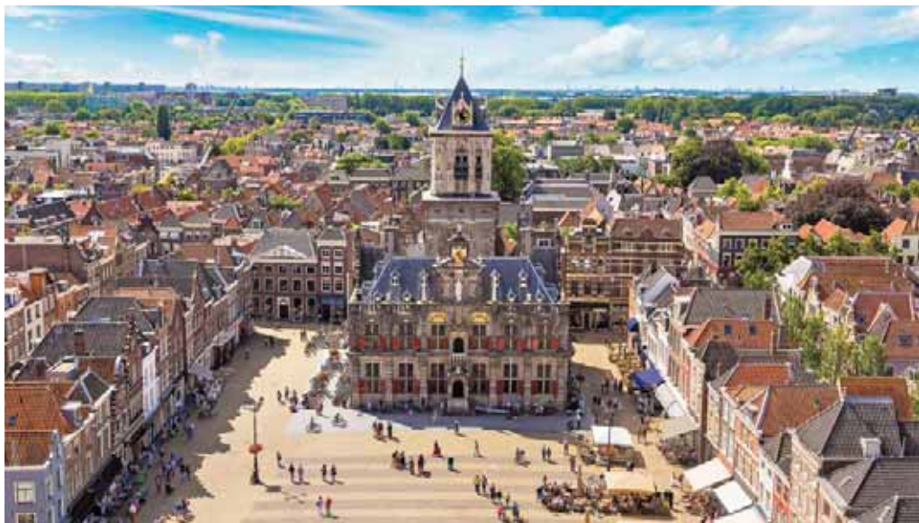
Old Town, Delft