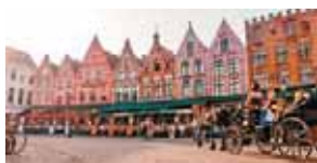
Old Town, Bruges