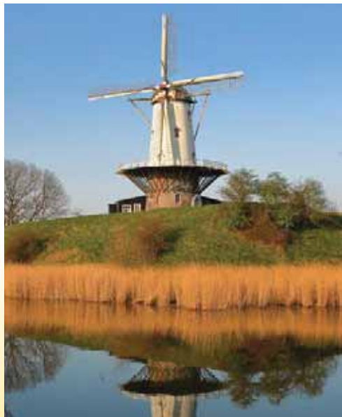
Windmill near Veere

Return to the ship for lunch and an afternoon of cruising toward Kampen.