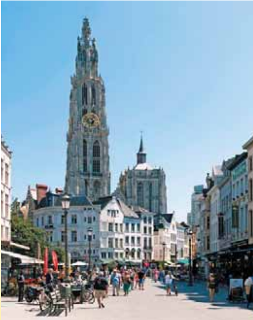
Cathedral of Our Lady, Antwerp