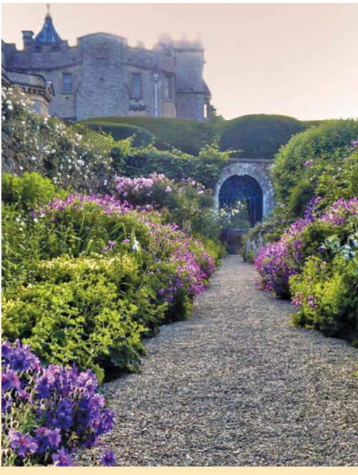
Rousham House and Gardens