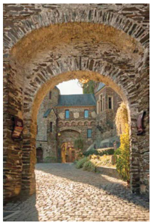
Reichsburg Castle, Cochem

Knowledgeable Lecturers deepen your appreciation for the region and its history, culture and current events.