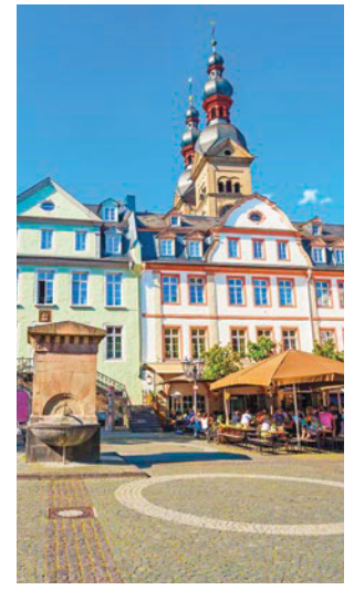
Market Square, Koblenz