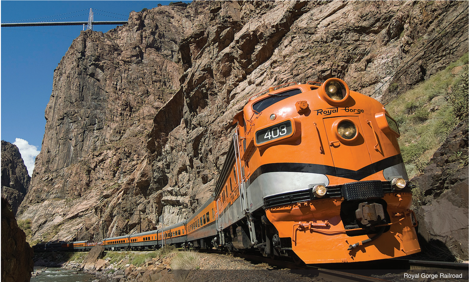
Royal Gorge Railroad