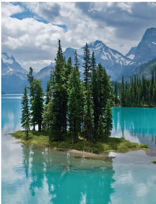
Spirit Island sits in stunning Maligne Lake.

Day 10: Banff Our last full day in the Canadian Rockies begins with a ride aboard the Banff Gondola to the top of Sulphur Mountain, so named for the hot springs on its lower flank. This 8,000-foot peak overlooking the town of Banff affords stunning mountain views in every direction; indeed, we can see six mountain ranges during this excursion. Then we travel Tunnel Mountain Road to visit two more natural wonders: the Hoodoos, a collection of eroded