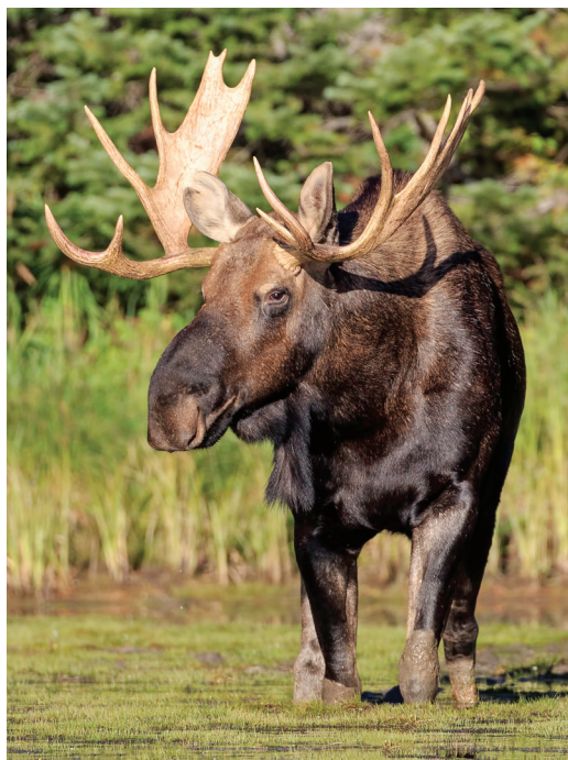
Moose abound in the Rockies.