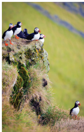
We may see puffins while on our tour.

rift valley. Revered for its historical importance – this is where Iceland’s Althing, or national assembly, met in open-air sessions from 930 CE to 1798 – Thingvellir also sits on an active volcanic site at the spot where the fissure between the geological plates of North America and Europe is most evident in Iceland. It’s also a gem of nature, with canyons, caves, waterfalls, and ponds surrounded by snowcapped mountains. We learn about the historic parliament founded here in 930 CE, and walk along a gorge into the rift valley itself. Following our visit here, we head to a local farm for lunch, then depart for famed Great Geysir and Gullfoss, Iceland’s immensely popular “golden” waterfall. We continue on to Reykjavik, home to more than half of the nation’s population and ranking as one