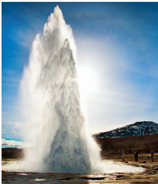
Iceland’s hot spring geysers are natural attractions.

Those who wish can join in an optional tour to the Sky Lagoon. Tonight, we celebrate our adventure over a farewell dinner. B,D