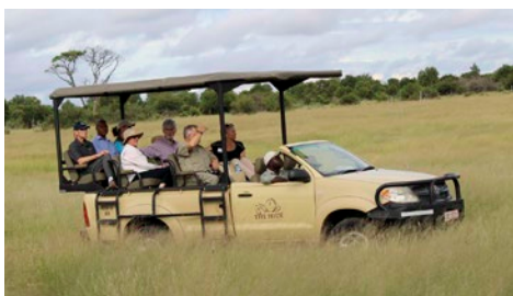
Top: Lion | Above: Safari