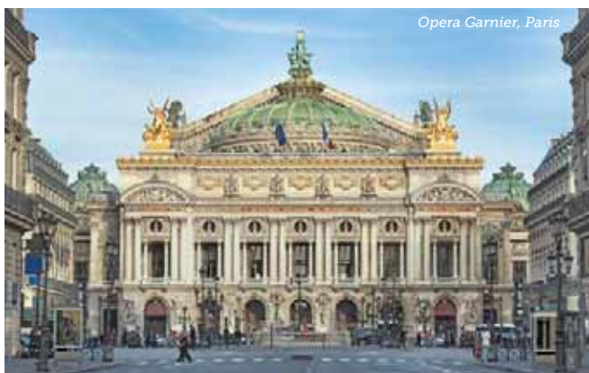
Opera Garnier, Paris