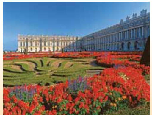
Gardens at Versailles