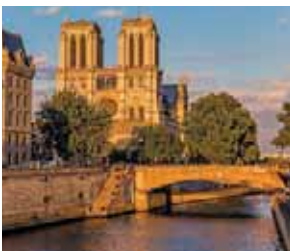
Notre Dame, Paris