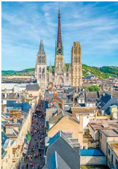
Notre-Dame de Rouen