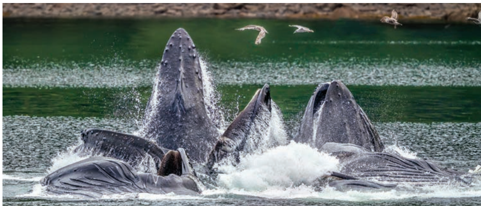
Humpback whales bubble-net feeding.

Reawaken your sense of awe on a six-day expedition along the untamed coasts of Alaska's Inside Passage. This pristine wilderness is home to a rich Tlingit culture, an enduring frontier spirit, and a panoply of wildlife—from high-flying eagles to tail-fluking whales. Hike through forests of towering trees, kayak in glacier-carved fjords, visit an ancient village, and more.