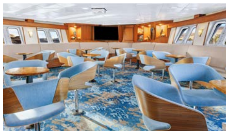
The lounge is the center of life aboard ship.

The ship features a library; global market; lounge with full-service bar and facilities for films, slide shows, and presentations; observation deck; partially covered sundeck with chairs and tables; and LEXspa. An open Bridge provides guests an opportunity to meet the officers and captain and learn about navigation.