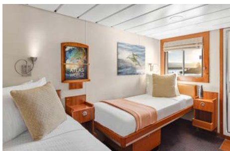
Category 2 cabin with single beds.

All cabins face outside with windows, private bathroom, and climate controls. Cabins are equipped with Wi-Fi and multiple electrical and USB outlets. Botanically inspired shampoo,