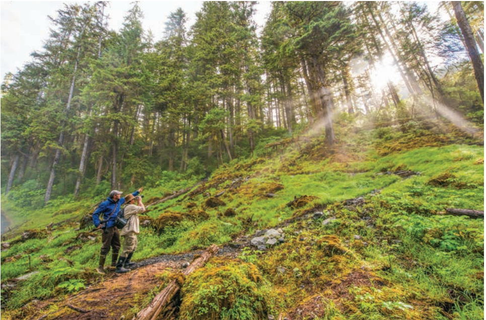
Hiking the Cascade Creek Trail in Tongass National Forest.

After breakfast, disembark in Juneau and transfer to the airport for your flight home. (B)