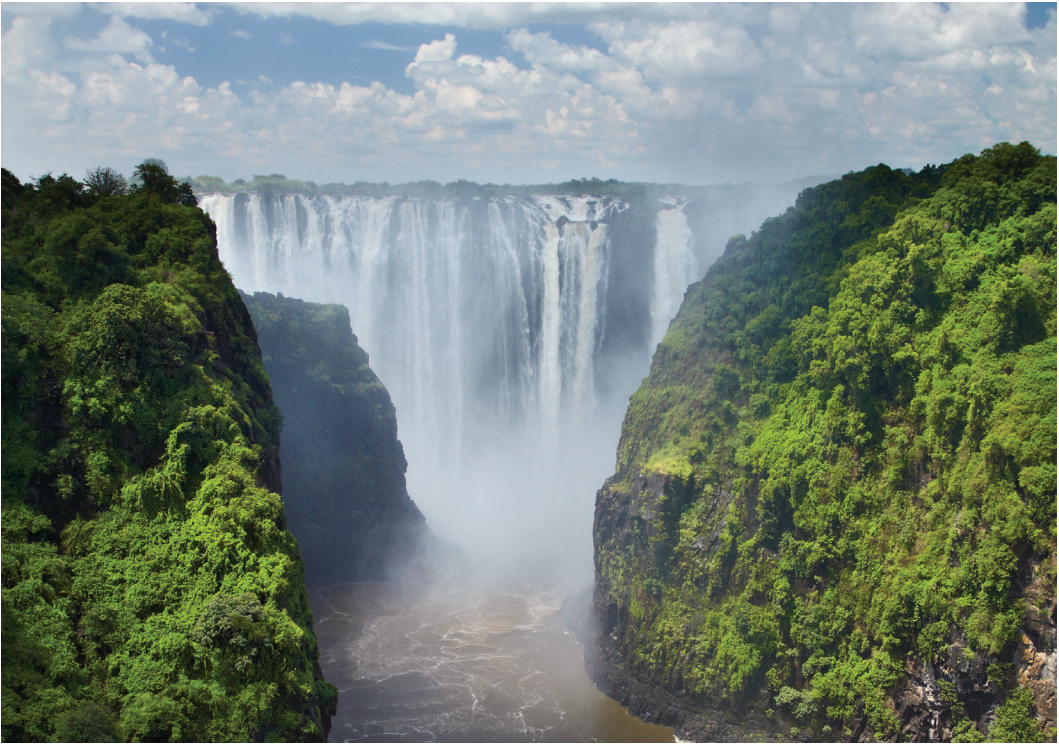
Victoria Falls, the “smoke that thunders”

embark on a game-viewing boat safari on the Chobe River, where we may see hippos, crocs, and some of the park’s 450 species of birds (including the sacred ibis, carmine bee-eaters, fish eagles, and kingfishers). We dine tonight at our lodge. B,L,D