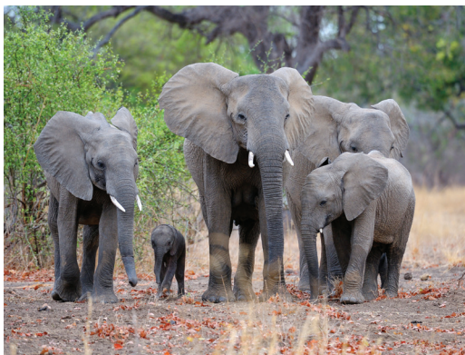
Chobe boasts the world's largest elephant population

to Lusaka, Zambia's capital, where we have hotel day rooms until our departure this evening for the airport and our overnight flight to the U.S. B