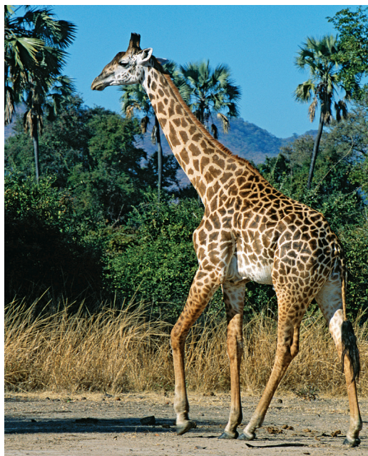
South Luangwa giraffe

Day 13: South Luangwa National Park/Lusaka/ Depart for U.S. We travel by light aircraft today