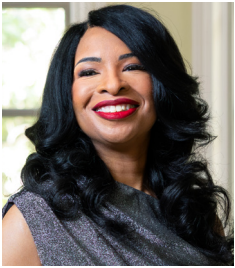
Arndrea Waters King

Renowned civil rights leaders and global humanitarians