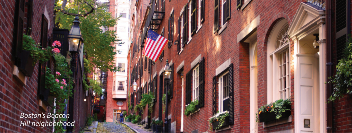
Boston's Beacon Hill neighborhood

Compagnie du PONANT, PONANT Group USA, LLC, and PONANT USA, LLC are hereinafter collectively referred to as "PONANT EXPLORATIONS GROUP" or "PONANT" is the tour Operator/Organizer of this cruise and has invited members of Oregon State University (Sponsor) to participate. Please carefully read this information as payment of a deposit represents your acceptance of the following Terms & Conditions, which constitute the sole, legally enforceable agreements between the passenger and PONANT GROUP and the tour's sponsoring organization.