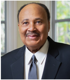
Martin Luther King III