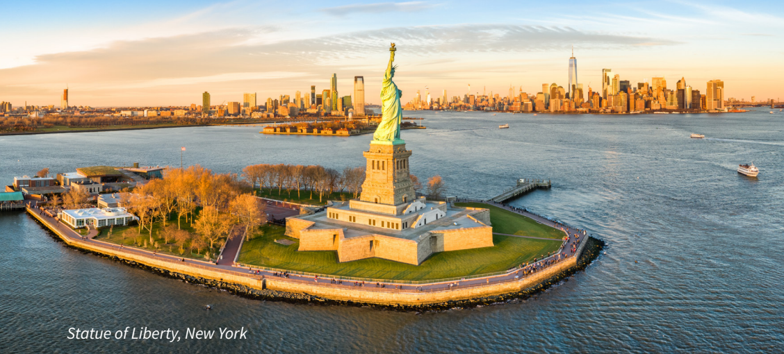
Statue of Liberty, New York