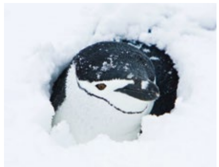
A chinstrap penguin burrowed in the snow.

This morning, the ship will be moored off of King George Island once again. Following disembarkation and Zodiac rides to shore, the flight departs the White Continent and returns to Puerto Natales for an overnight stay. (B,L,D)