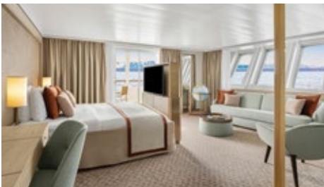
Newly renovated Category 7 suite with balcony.

All cabins and suites face outside with windows or portholes, and have a private bathroom and climate controls. Equipped with Wi-Fi, multiple electrical outlets, USB outlets, full-length mirror