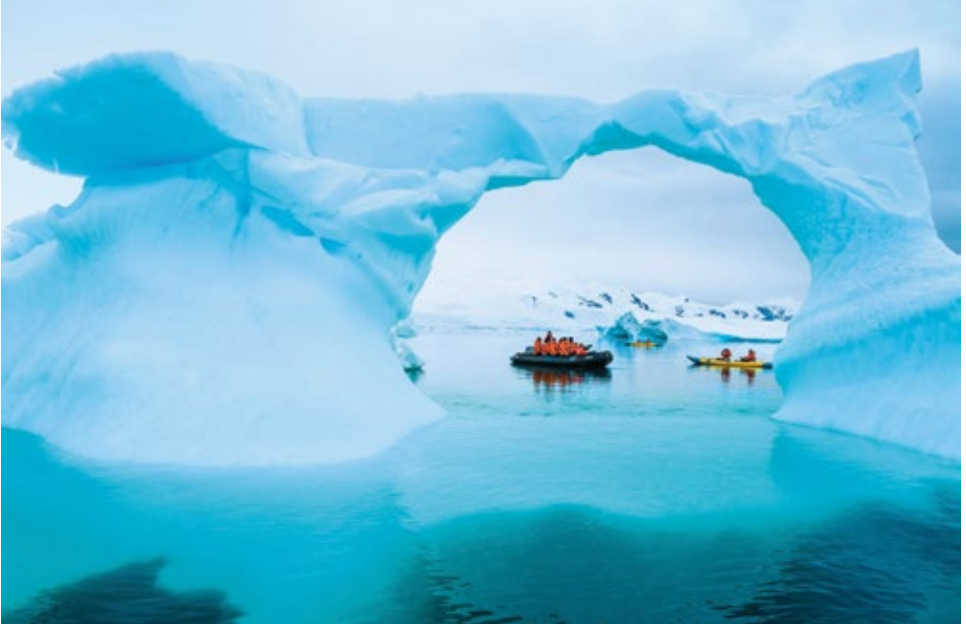
Guests exploring by Zodiac in Antarctica.

cruise amid porpoising penguins. While wildlife is magnificent, ice defines the Antarctic. You'll get to know ice up close and personal—from icebergs the size of islands, bergy bits and near-vertical glaciers, to the fragile, nearly invisible layers that have just begun to freeze. One day, you might set out by kayak to encounter towering icebergs at water level; embark on a Zodiac excursion in search of seals and blue-eyed shags; or walk amid thousands of Adélie and gentoo penguins. The next, you might experience the thrill of the ship crunching through pack ice. In Antarctica, opportunities abound to capture uniquely beautiful images. Along the way your expert expedition team will enrich every experience. (B,L,D)