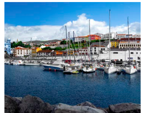
Angra do Heroísmo