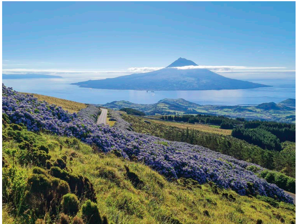
The view of Pico Island from Faial Island