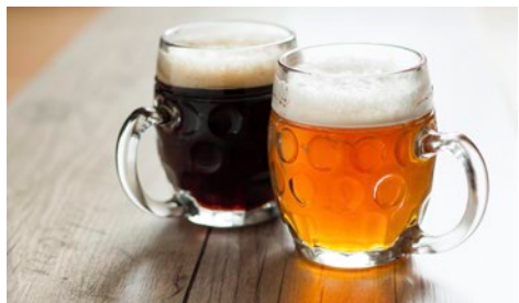
Top: Charles Bridge, Prague | Above: Czech beer