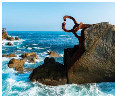
The Comb of The Wind, San Sebastián

🔄 AHI FlexAir | Our personalized air program features transfers, assistance and flexibility.