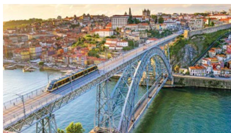
Top: Douro Valley | Above: Porto