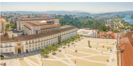
University of Coimbra

Activity Level: We have rated all of our excursions with activity levels to help you assess this program's physical expectations. Please call or visit our website for full details.