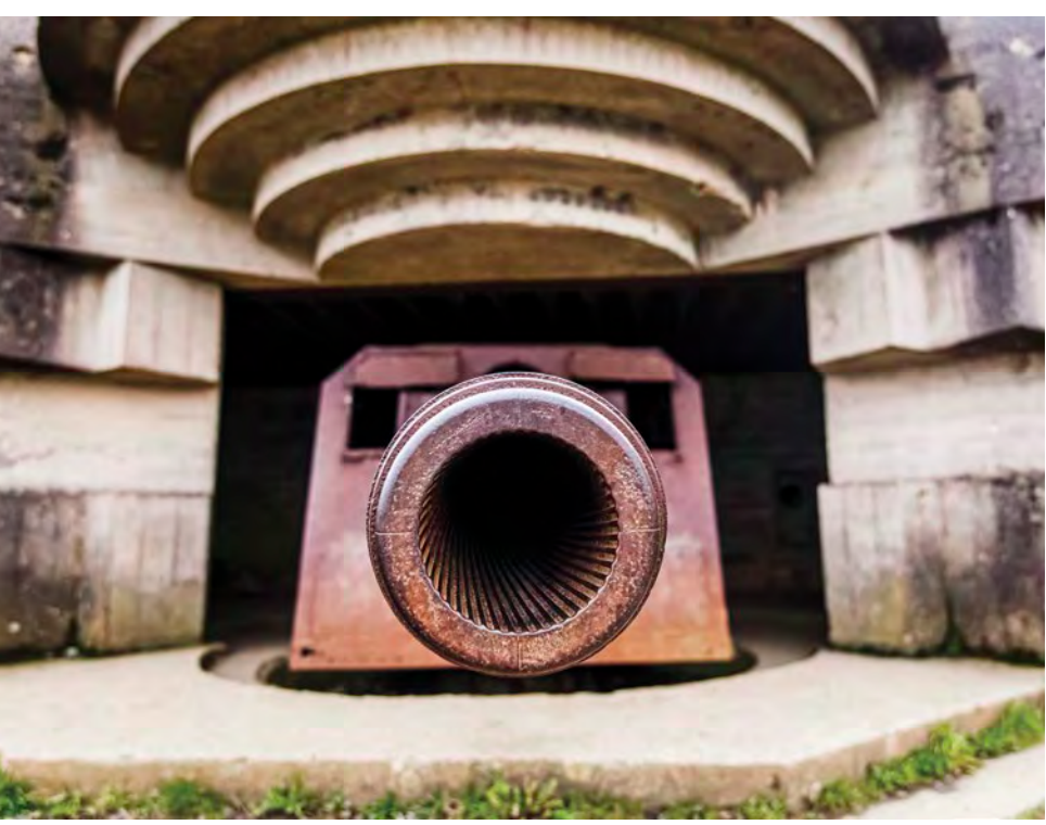
Barrel of a cannon, Omaha Beach

Honfleur. Craft your own itinerary during a full day at leisure in this picturesque coastal town, immortalized in paintings by Claude Monet. Stroll among the vendors on market days, situated around the great wooden Church of St. Catherine, wander its medieval cobblestone streets and admire timbered houses along the historic harbor.