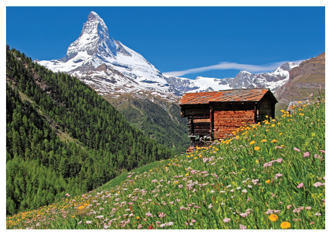
The Matterhorn presides over charming Swiss villages and meadows dotted with wildflowers.

Pass through the Alps. Late morning, we arrive in Stresa, Italy, along the shores of lovely Lake Maggiore, where we have time to explore and enjoy lunch on our own. Then a scenic drive through the famed Italian lake district returns us to Switzerland and our hotel in lakeside Lugano. B , D