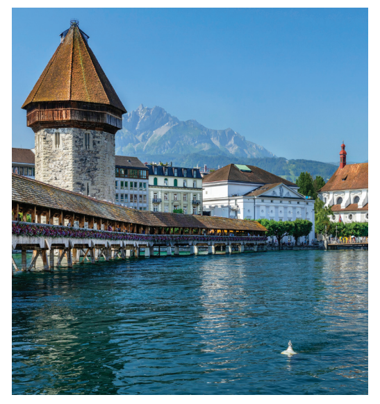
Lucerne's beloved Kapellbrücke (Chapel Bridge)