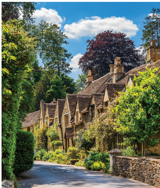
Rural Cotswolds village

and Hyde Park. Our afternoon is at leisure to explore this wondrous city as we wish; London offers an embarrassment of riches from which to choose. Tonight we celebrate our journey through Britain at a farewell dinner. B,D