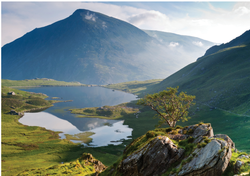
Wales' pristine Snowdonia National Park, which we visit on Day 8.

Day 7: Lake District/North Wales We travel through splendid Lake District scenery today en route to Wales, with its rugged natural beauty and distinct culture. Our first stop is at Bodnant Garden, the historic 80-acre National Trust property with a lovely hillside setting and ever-changing displays, from manicured lawns to flower-filled terraces. After our visit, we continue on to the seaside town of Llandudno, dubbed “Queen of the Welsh Resorts,” and our home for the next two nights. We dine tonight at our hotel. B,D