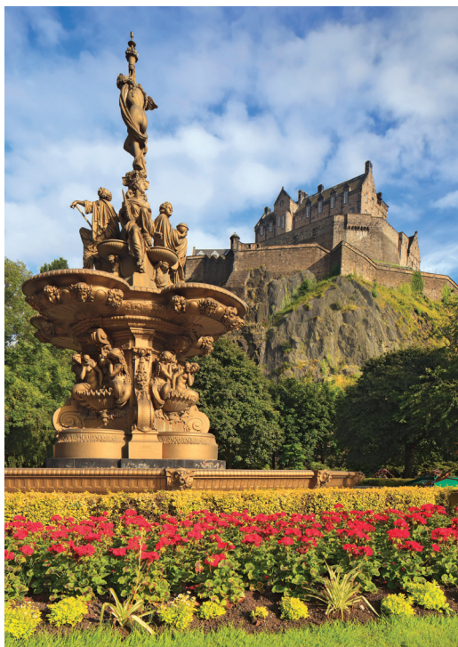
Scotland’s Edinburgh Castle

Day 13: London A panoramic city tour this morning passes such celebrated London landmarks as the infamous Tower of London, grand Parliament and Big Ben, Buckingham Palace, Westminster Abbey,