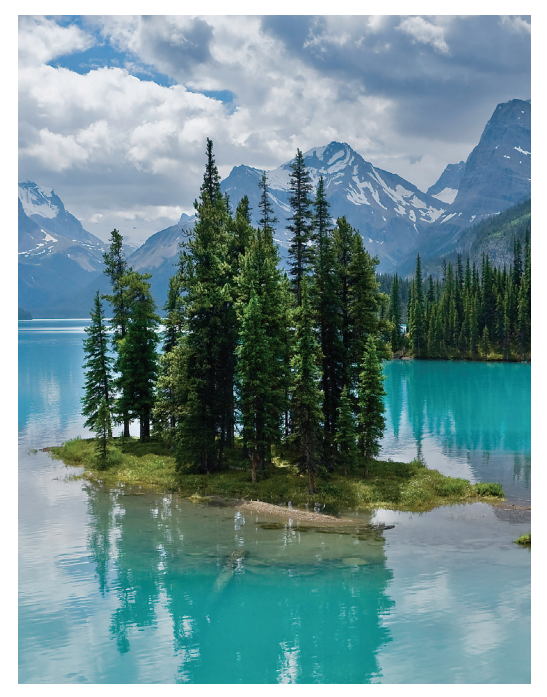
Spirit Island sits in stunning Maligne Lake.

limestone spires strung along a wooded hillside; and Bow Falls, a wide waterfall just outside Banff. The afternoon is free to explore Banff before we celebrate our outdoor adventures with a farewell dinner at our hotel. B,D