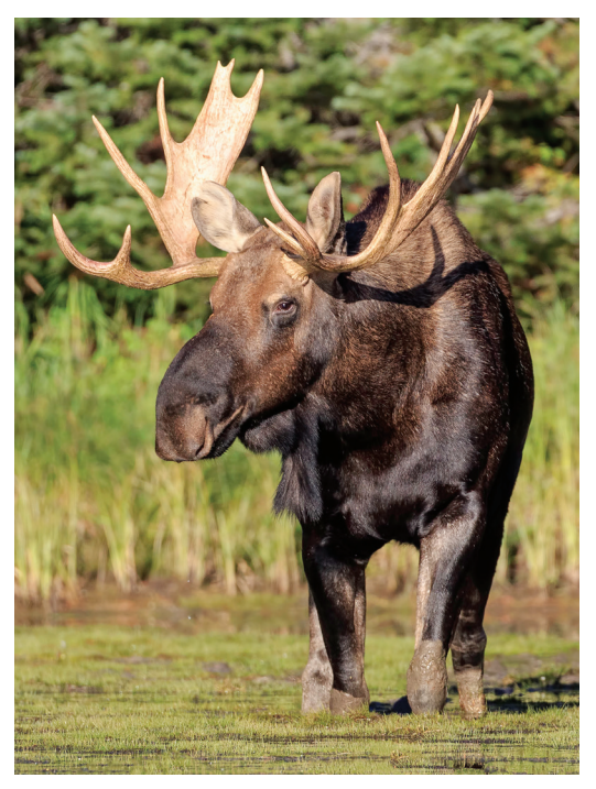
Moose abound in the Rockies.

Day 10: Banff Our last full day in the Canadian Rockies begins with a ride aboard the Banff Gondola to the top of Sulphur Mountain, so named for the hot springs on its lower flank. This 8,000-foot peak overlooking the town of Banff affords stunning mountain views in every direction; indeed, we can see six mountain ranges during this excursion. Then we travel Tunnel Mountain Road to visit two more natural wonders: the Hoodoos, a collection of eroded