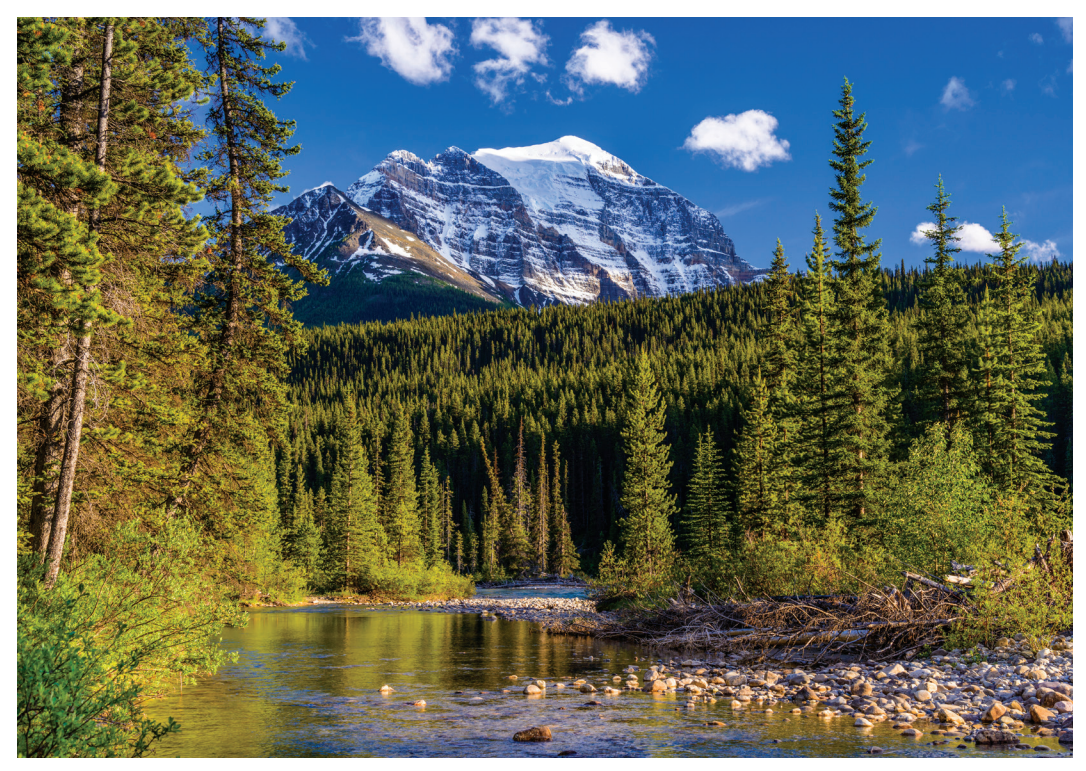
Five national parks sit within the Canadian Rockies.

a winding mountain pass that offers breathtaking views and hair-raising turns. After time for lunch on our own we meet up with our motorcoach and continue southwest across the Continental Divide. After arriving late this afternoon in the resort town of Whitefish, Montana, we dine together tonight. B , D