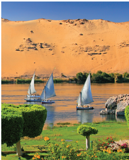
We sail traditional feluccas along the Nile.

Day 14: Cairo Today’s touring begins at the openair museum at Memphis, Egypt’s first capital (3100 BCE),