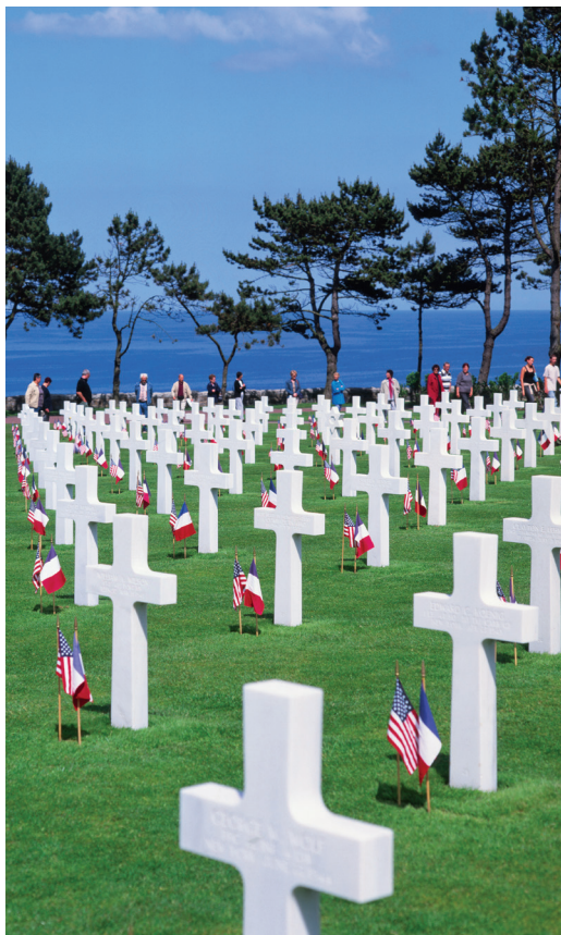
We visit the American Cemetery at Omaha Beach.