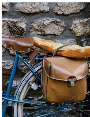
Typical French scene

Paris, reaching our hotel late afternoon. We are free for dinner on our own in this culinary capital. B