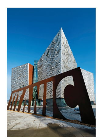
Titanic Museum, optional extension

Day 11: Kilkenny Today is devoted to Kilkenny, a well-preserved medieval city known as Ireland's cultural capital – and the country's smallest city. We tour 12<sup>th</sup>-century Kilkenny Castle, considered one of the country's most beautiful, then embark on an informal walking