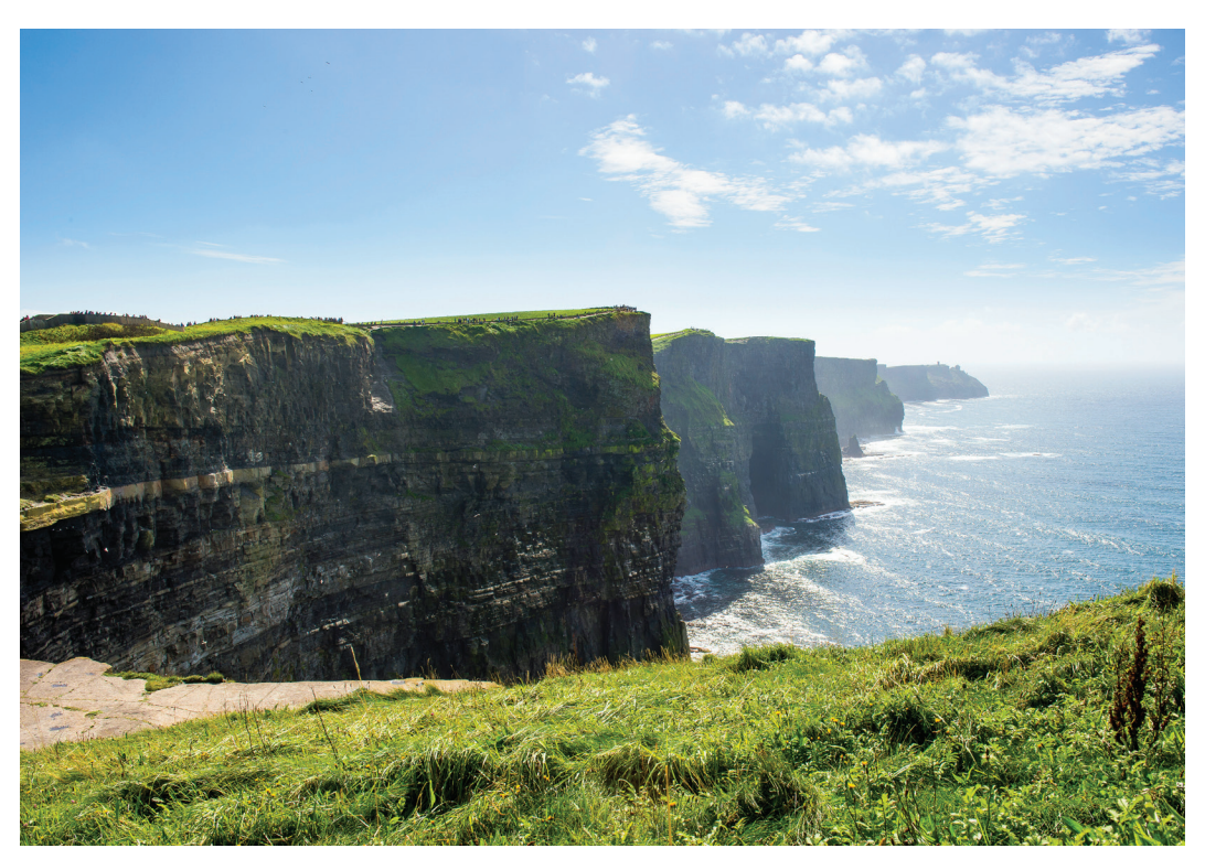
The sun shines down on the Cliffs of Moher, as we see on Day 7.

here, imparting local lore along the way. We stop at Dun Aenghus Fortress, the three prehistoric stone walls crowning the tallest cliffs of Inishmore; have lunch in a local pub; and enjoy some free time before returning to the mainland and our hotel late this afternoon. Dinner tonight is at a local restaurant in the village of Bearna. B , L , D