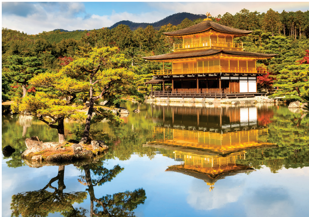
We visit Kyoto's Temple of the Golden Pavilion on Day 10.

Day 6: Hakone/Takayama Today we travel first by bullet train then by Wide View Hida express train to lovely Takayama in the Japanese Alps, considered one of the country's most attractive towns with its beautifully preserved Old Town. Our explorations center on three narrow streets in the San-machi-suji district where, in feudal times, merchants lived amidst the authentically preserved small inns, teahouses, and sake breweries. This afternoon we attend a traditional Japanese tea ceremony here, an historic ritual of form, grace, and spirituality. B,D