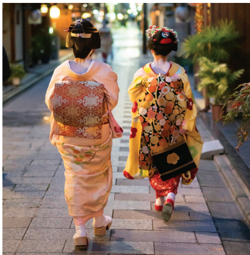
Geishas in traditional dress

temple housing 1,000 statues of the Thousand-Armed-Kannon deity; and Nishiki Market, “Kyoto’s Kitchen” of restaurants, stores, and stalls selling everything food-related. Then this afternoon is at leisure; tonight, we toast our adventure at a farewell dinner at a local restaurant. B,D