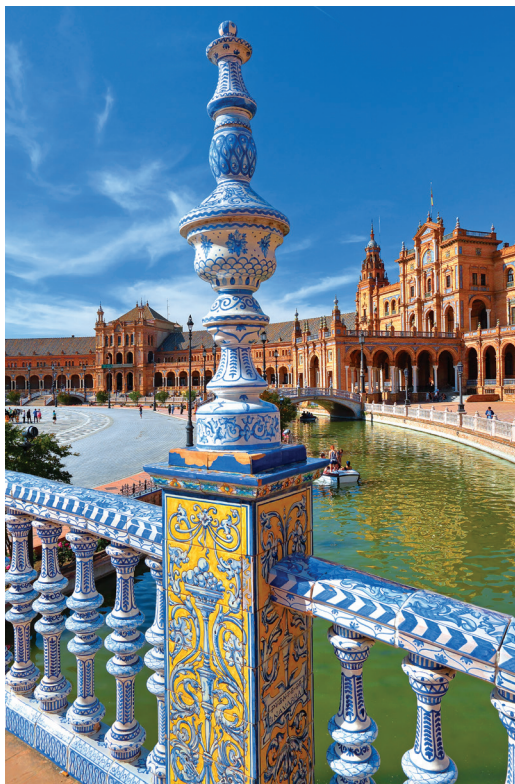
Seville's colorful Plaza de España