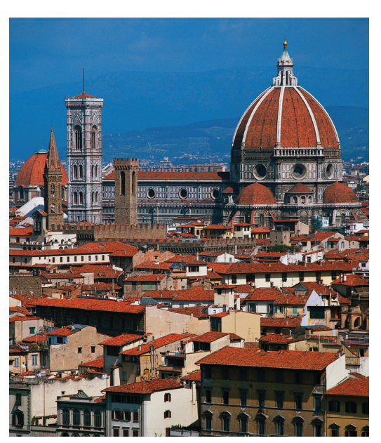
We visit splendid Florence on Day 13