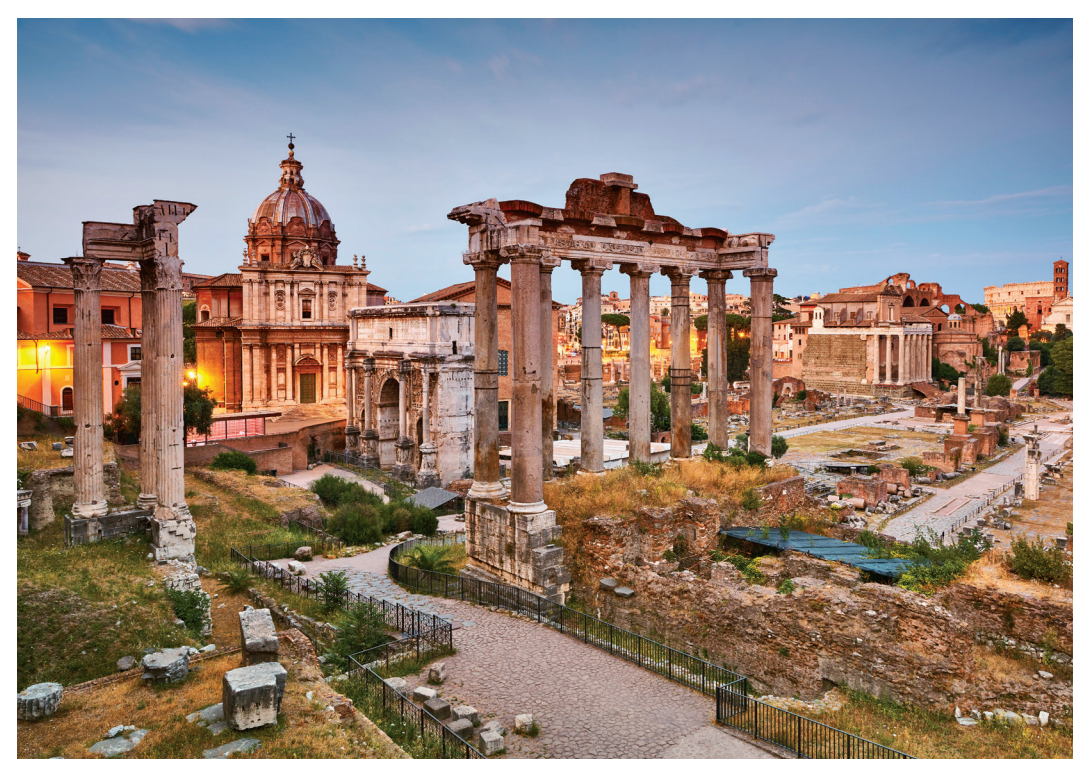
The Roman Forum dates to the 7th century BCE.

shopping along the fashionable Via Veneto; sipping espresso in beautiful Piazza Navona; seeing the Pantheon, the city's best preserved ancient building; tossing a coin into Trevi Fountain; or visiting any number of renowned museums and churches. B