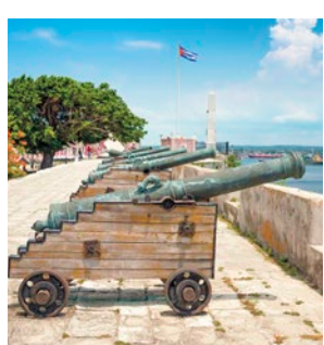
Cannons at fortification, Havana