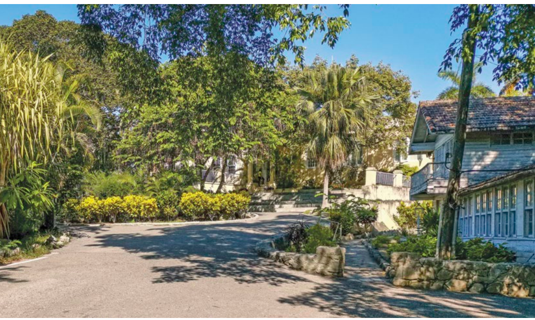
La Finca Vigia museum, Ernest Hemingway's home