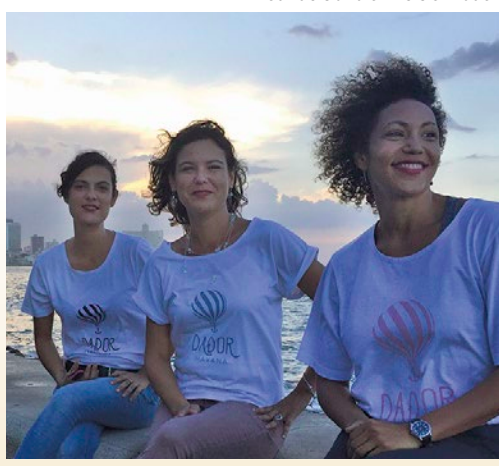
Founders and owners of Dador

of the property followed by dinner at a paladar.